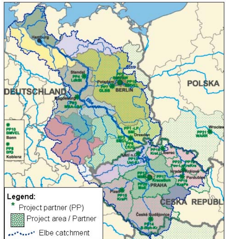
ELLA project region

In the Saxon pilot projects “Upper Elbe Valley/ Eastern Ore Mountains” and “Region Chemnitz” the requirements for preventive flood control are being integrated in the regional plan. Within the projects hazard-indication maps showing the flood water levels and specific runoff