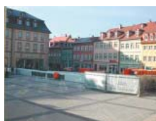
City of Bamberg

framework for action will be developed and implemented during the second project phase by the Bavarian Ministry of Economic Affairs, the Bavarian Ministry of the Interior and the city of Bamberg supported by a working group of three institutions. At local level the project is closely cooperating with the bureau of the mayor of Bamberg.